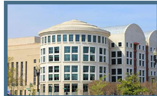
E. Barrett Prettyman U.S. Courthouse and William B. Bryant Annex