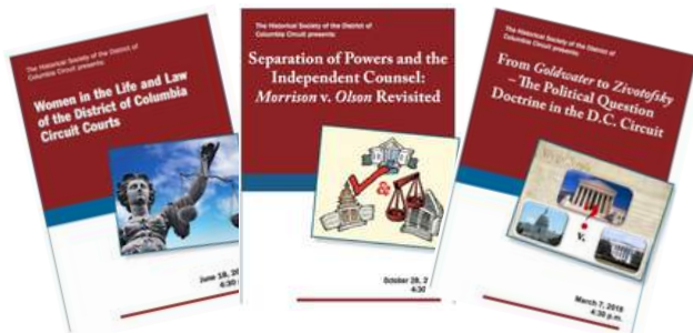
Three brochures of prior Historical Society programs that can be viewed in their entirety on the Society's website.

A survey of the scope and viability of the political question doctrine today in "From Goldwater to Zivotofsky ".