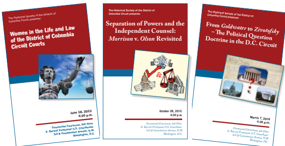
Three brochures of prior Historical Society programs that can be viewed in their entirety on the Society’s website

A program, temporarily delayed by COVID-19, on the D.C. Circuit’s 2001 en banc antitrust decision in United States v. Microsoft Corp. , featuring a reenactment of the argument and a panel discussion of what it is that causes activity of a successful technology firm to cross the line and become a violation of Section 2 of the Sherman Act