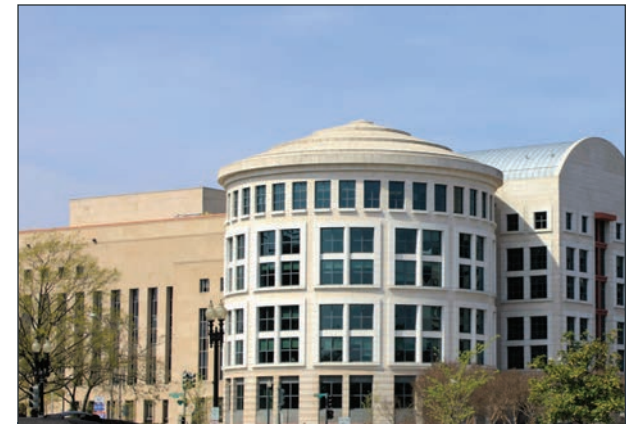
E. Barrett Prettyman U.S. Courthouse and William B. Bryant Annex