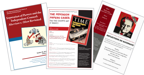
Three flyers announcing Historical Society programs

Celebrating the life and history of the D.C. Circuit Courts, the Society: