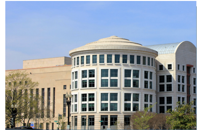
E. Barrett Prettyman U.S. Courthouse and William B. Bryant Annex